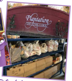
Plantation on the Lake