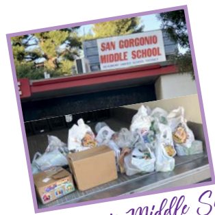
San Geronio Middle School